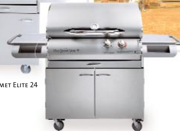
PATIO GOURMET ELITE 36