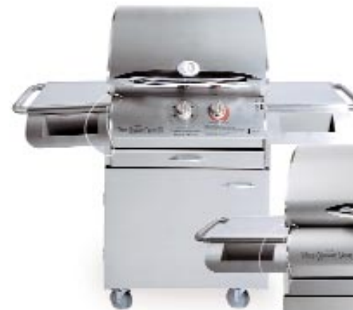
PATIO GOURMET ELITE 24

PATIO GOURMET ELITE DROP-IN UNIT SHOWN HERE WITH OPTIONAL CUSTOM-FINISHED GRILL ISLAND BUILDER SET